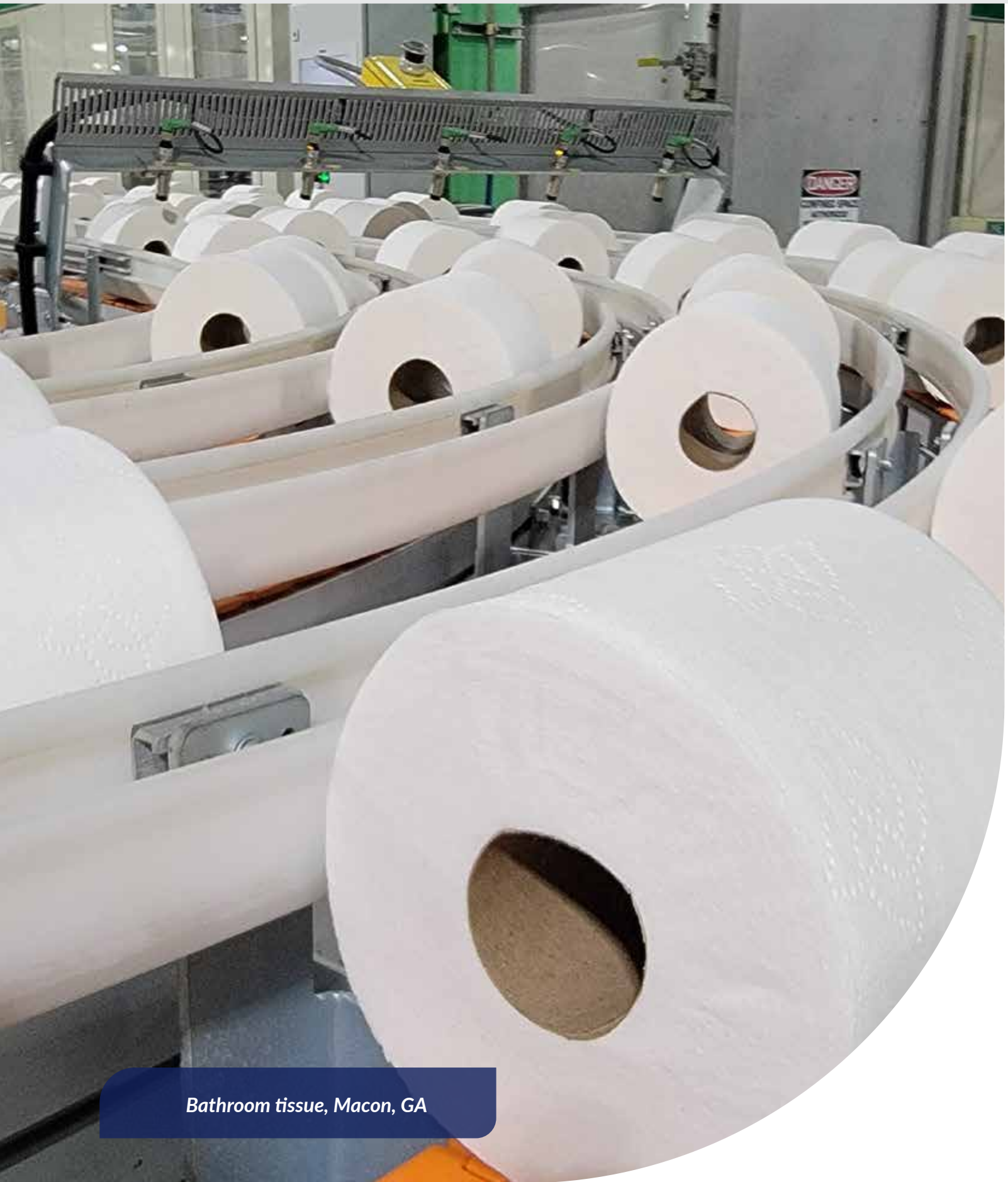
Bathroom tissue, Macon, GA