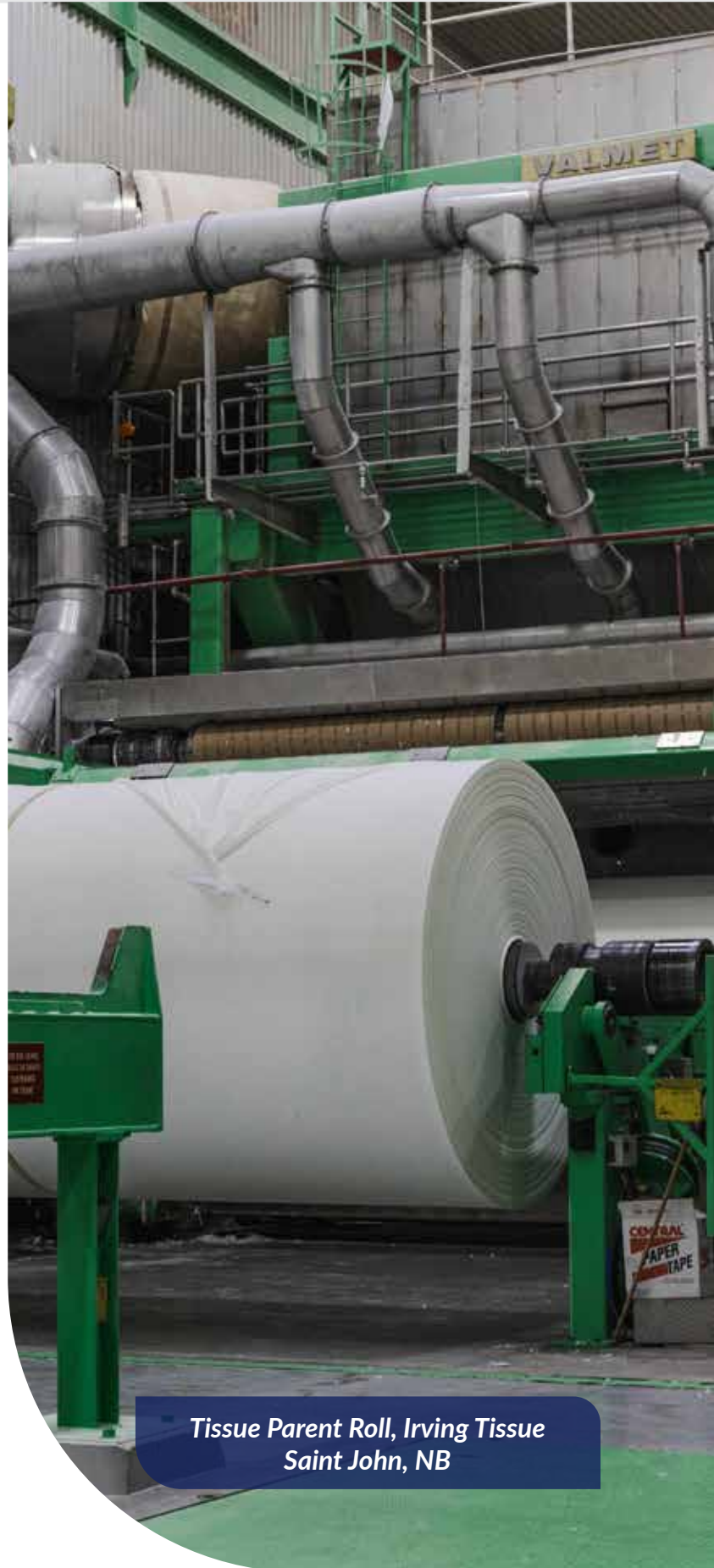
Tissue Parent Roll, Irving Tissue Saint John, NB

For more information on the organizational Carbon Neutrality Management Plan and the Carbon Neutrality Pathway, please reference the Full Report.